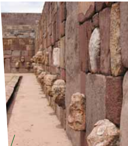
Archaeological site of Tiwanaku: Spiritual and Political Centre of the Tiwanaku Culture, Bolivia (WHC No. 567rev).

One of the main concerns from recent years is how the condition of World Heritage can contribute to sustainable development and improve the quality of life of local communities. The role of heritage as driver of development was explored by ICOMOS during the Scientific Symposium held in the framework of its 17 th General Assembly. The "Paris Declaration", the final document