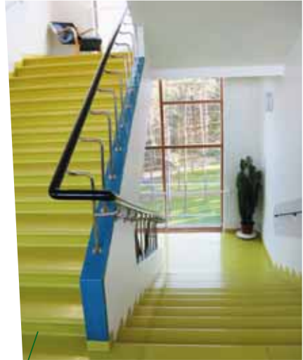
Interior of Paimio Sanatorium, Finland (Alvar Aalto, 1930-33). The original colour scheme and furniture is carefully conserved within current hospital usage.

How do we identify and select what are the significant places for the twentieth century - there are too many! Do the buildings and places of the modern era have different conservation issues to consider in terms of change - such as their specific materiality and functionality? What role do original designers have with proposed changes to their buildings? How much change is too much? Which layers of change are significant? Of course, many of these questions apply to all forms and eras of heritage.