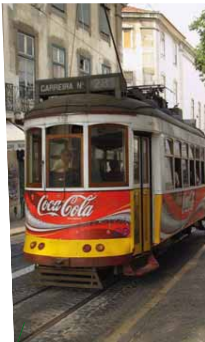
Lisbon's tramway No. 28, a historic monument as a modern advertising billboard – Portugal.