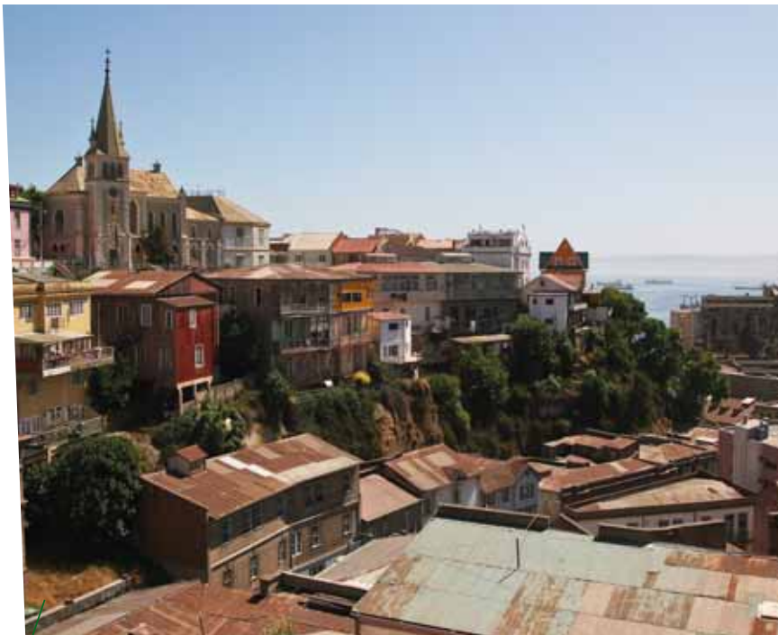
Valparaíso, Chile, a clear example of the interaction between the conditions of a site and the different layers of development of the human settlement.

processes, and the intangible dimensions of heritage as related to diversity and identity.