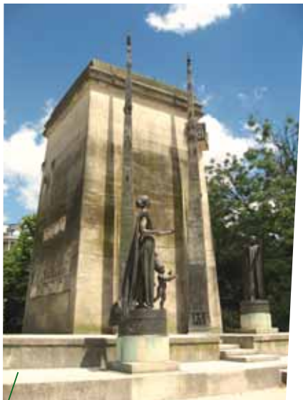
Monument to commemorate the Declaration of the Rights of Man and of the Citizen (Champ de Mars, Paris, 1989).

human rights by adopting the 1998 “Stockholm Declaration” in celebration of the 50 th anniversary of the UDHR. More recently, ICOMOS has been active in developing a dialogue on this subject by: