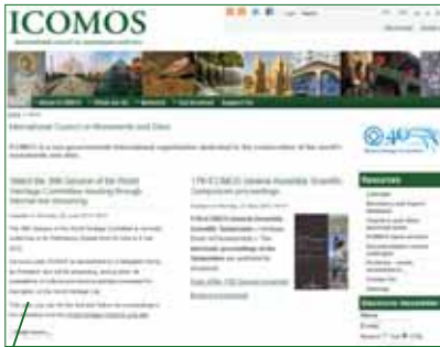
ICOMOS' new website interface.

Following a major overhaul of its design, structure and functionality, the new website was launched on 25 November 2011, on the occasion of the 17 th General Assembly.