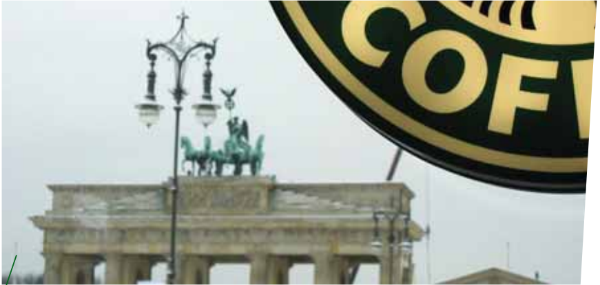
Negative visual impact of corporate branding at Brandenburg Gate, Berlin, Germany.

commitment to local communities. This indicates that corporations do not consider heritage when dealing with these topics, providing a strong reason to implement this project;