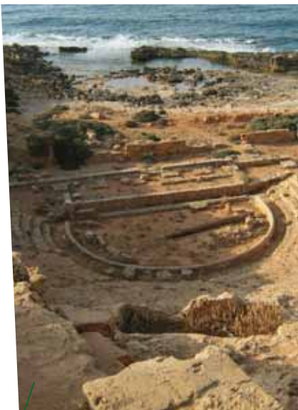
The Amphitheatre at the port of Apollonia Cyrenaica, submerged in antiquity, with archaeological remains stretching far into the sea.

There is a high risk of destruction during this period of transition in the absence of administration and civil