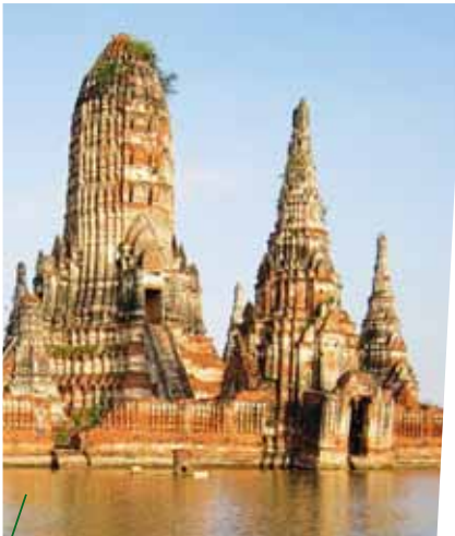
The temple of Wat Chai Wattanaram at Ayutthaya, during the 2011 flood.